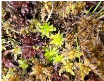
Sphagnum aongstroemii at Samsjøen.